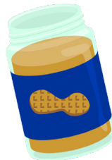
☐ Peanut ☐ Butter